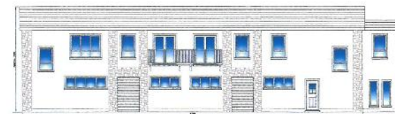
Proposed Northeast Elevation

The full plans are available on our website.